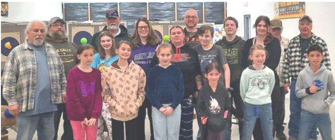
Basic archery participants and instructors from the recent class.

All of these events mentioned required DSC Archery Committee members going above and beyond to make these events the success they were and hopefully continue to be.